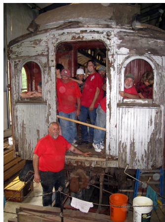
Clampers at Train Work party