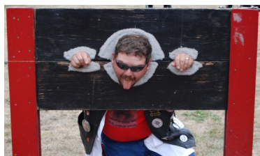
Crash in Stocks

First the train museum, the people with the museum seem to be pleased